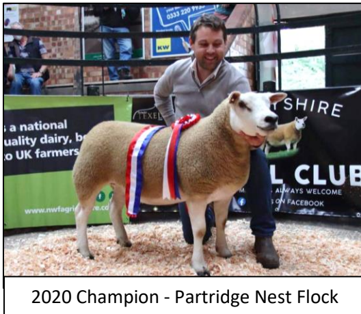
2020 Champion - Partridge Nest Flock